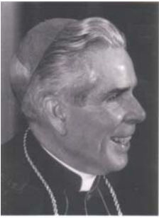
Servant of God ARCHBISHOP FULTON J. SHEEN (1895-1979)