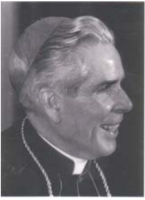
Servant of God ARCHBISHOP FULTON J. SHEEN (1895-1979)